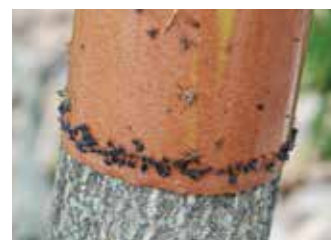
Figure 4. A banded tree with SLF nymphs stuck at the bottom.

When the nymphs first hatch, they will walk up the trees to feed on the softer new growth of the plant. Take advantage of this behavior by wrapping tree trunks in sticky tape and trapping the nymphs. Any tree can be banded, but we recommend only banding trees where SLF are abundant (Figure 4). Tape may be purchased online or from your local garden center. Push pins can be used to secure the band. While some bands may catch adults, banding trees is most effective for nymphs. Be advised that birds and small mammals stuck to the tape, while rare, have been reported. To avoid this, you can cage your sticky bands in wire or fencing material wrapped around the tree. Alternately, try reducing the width of the band, so that less surface area is exposed to birds and other mammals. Both of these methods will still capture SLF effectively. Check and change traps at least every other week (or more often in highly infested areas).