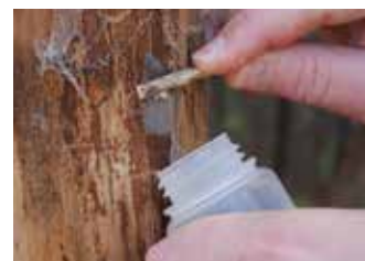
Figure 3. Scraping SLF egg masses from a tree.

Walk around your property to check for egg masses on trees, cement blocks, rocks, and any other hard surface. If you find egg masses on your property from September to May, you can scrape them off using a plastic card or putty knife (Figure 3). Scrape them into a bag or container filled with rubbing alcohol or hand sanitizer. This is the most effective way to kill the eggs, but they can also be smashed or burned. Remember that some eggs will be laid at the tops of trees and may not be possible to reach.