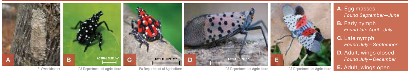
Figure 1. The life stages of SLF, including an egg mass on a tree.

dots and black stripes (Figure 1). SLF adults emerge in July and are active until winter. This is the most obvious and easily detectable stage because they are large (~1 inch) and highly mobile. Adults have black bodies with brightly colored wings. Only the adults can fly. Because SLF adults jump more than fly, their wings often remain closed. SLF wings are gray with black spots, and the tips of the wings are black with gray veins.